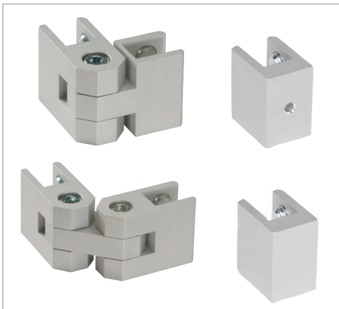
Connectors 10-13 mm and 13-16 mm Steel screws