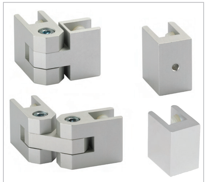
Connectors 10-13 mm and 13-16 mm Plastic screws